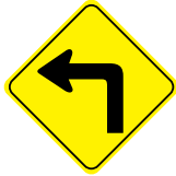
Sharp Turn Ahead