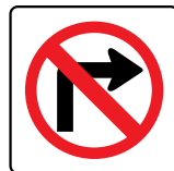
No Right Turn