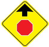
Stop Sign Ahead