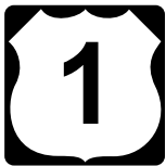
U.S. Route Marker