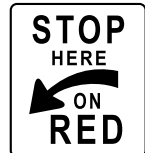
Stop Here on Red