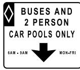
Bus/Car Pool Lane