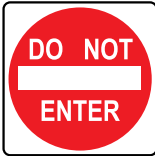
Do Not Enter