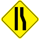
Lane Reduction Ahead