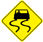
Slippery When Wet