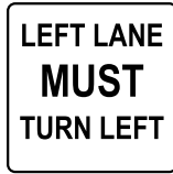
Left Turn Only