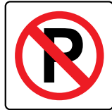
No Parking Any Time