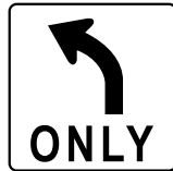
Left Turn Only