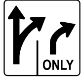
Multiple Turning Lanes