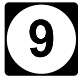
State Route Marker