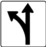
Left or Straight Only