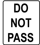
Do Not Pass